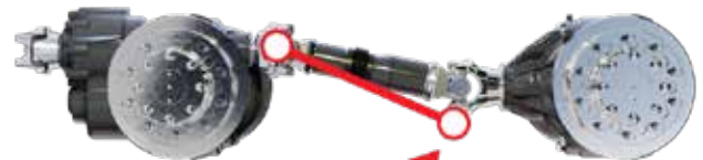
Improved Dana Tandem Position